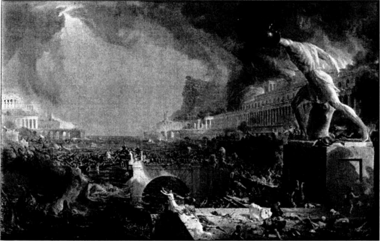
The Destruction of Empire , painted by the American artist Thomas Cole in 1836.

Overview: From about 50 BCE until the year 200 CE, the Roman Empire was the superpower of the Mediterranean world. During that time, the empire's wealth, territory and international status grew and grew. But even as the empire prospered, it was slowly starting to fall apart. Some of its problems were internal – coming from within Rome itself – and others were external. This Mini-Q explores the factors that led to the eventual fall of one of history's most powerful and influential empires.